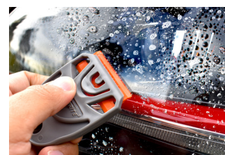
Car detailing & cleaning