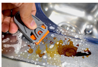
Steel surface residue removal