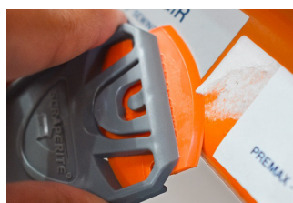
Sticker & label removal