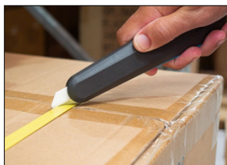
Cut strapping at 45° angle

Self-retracts when blade loses contact with cutting surface, even with the user's thumb still on the slider button.