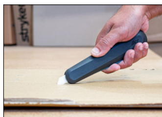
Open and disassemble boxes