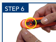
STEP 6 Load blade until centre hole aligns with rectangular slot