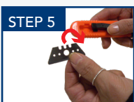
STEP 5 Rotate the blade before reloading or replace with new blade