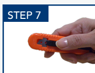
STEP 7 Push the black slider back into the rectangular slot