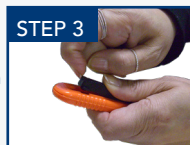
STEP 3 Lift the black slider upwards