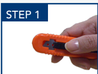
STEP 1 Hold knife with the black slider facing you