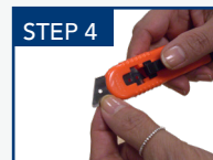
STEP 4 Carefully take the blade out