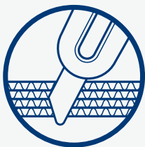
Longer blade for thicker cuts