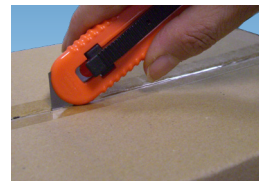
2. Release the blade slider while cutting