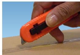
1. Push the blade slider forward to extend blade